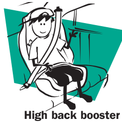
High back booster